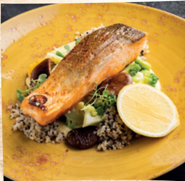
Grilled salmon steak with Thai cauliflower puree, quinoa, coriander flavoured cauliflower ragu and shiitake mushrooms