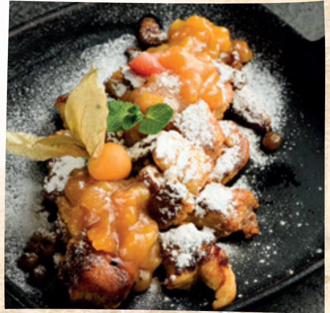
Kaiserschmarrn with home-made apricot marmalade