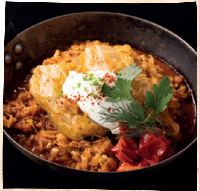
Vegan stuffed cabbage with red lentils and bulgur