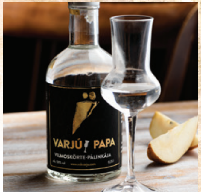
VarjúPapa's palinka 6 890 HUF/bottle/take away