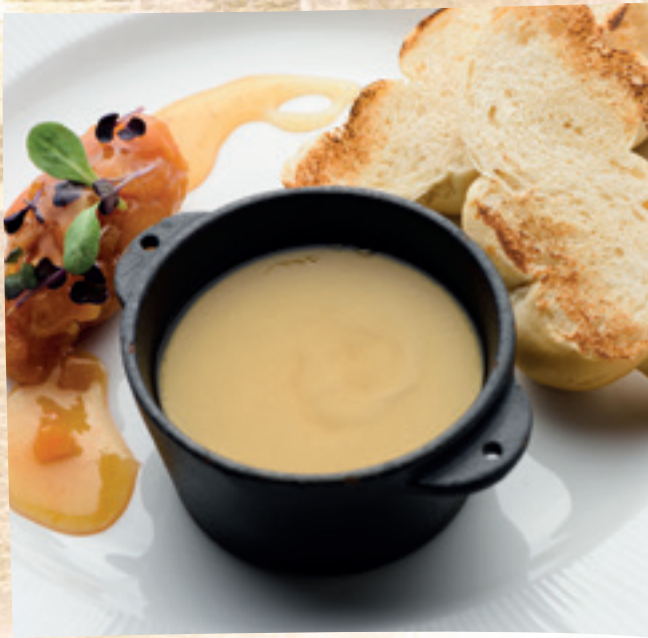
Duck liver mousse with Tokaji wine-jelly, pear textures and milkloaf