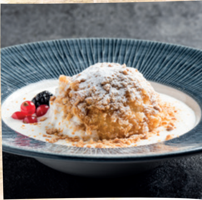
Cottage cheese dumpling with macaroon flavoured sour cream