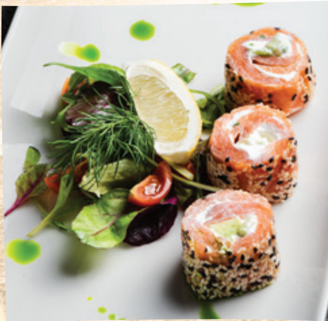
Sesame seed covered smoked salmon roll stuffed with avocado and cream cheese cucumber