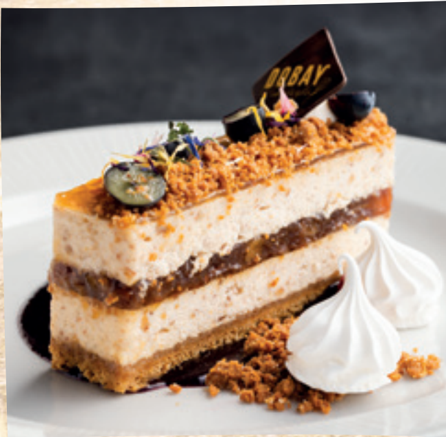
Fig-pecan mousse with gingerbread, blueberry coulis and caramel crumble