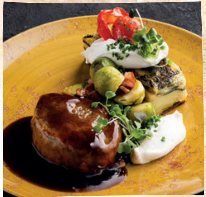
Beef tenderloin steak with spinach flavoured potato gratin, Brussels sprouts with bacon and goat cheese flavoured kefir