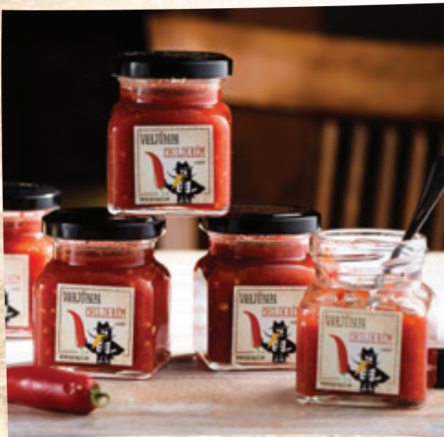
VarjúPapa chili cream: 1 990 HUF/piece