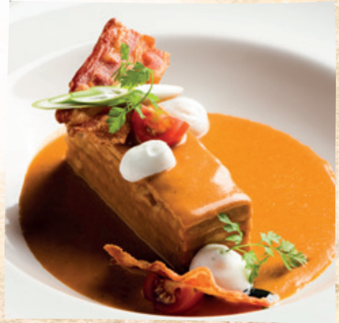
Stuffed crepe "Hortobágy" style