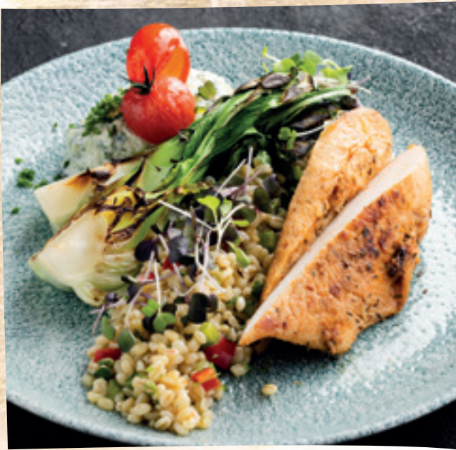
Grilled Cajun flavoured chicken breast with coriander tabbouleh salad, raita yoghurt sauce and grilled pak choi