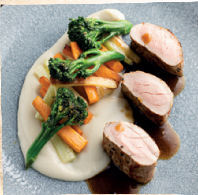
Pork tenderloin in pepper crust with smoky artichoke puree, wild broccoli and roasted root vegetables