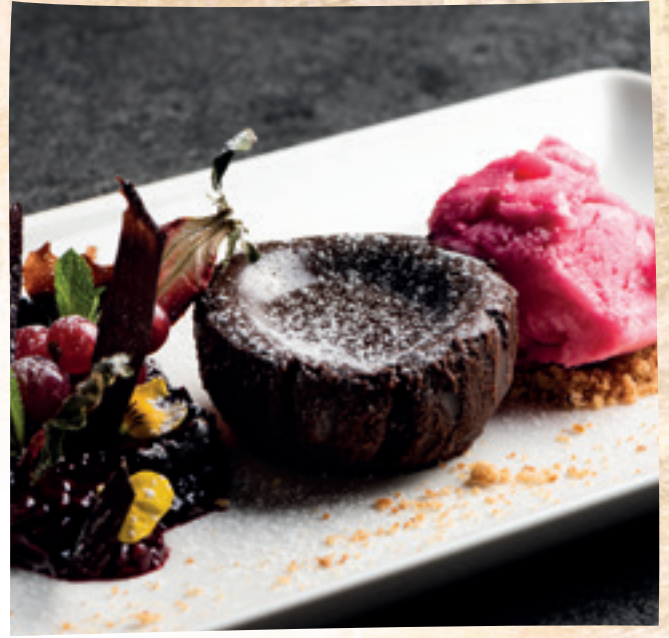
Chocolate soufflé with raspberry ice cream