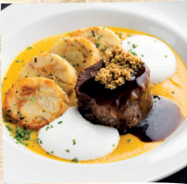
Confited beef cheek “Vadas” style with bread dumpling and sour cream