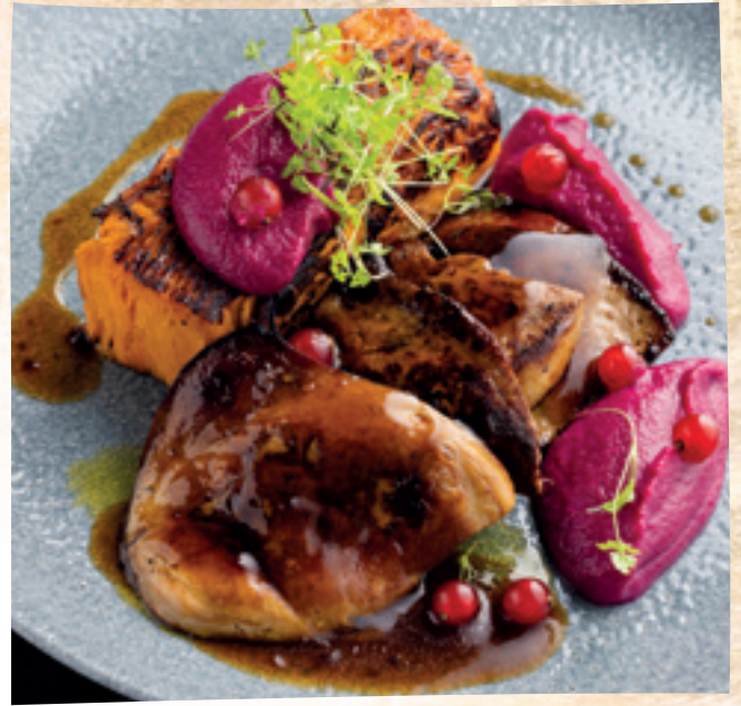
Pan-fried fat duck liver with sweet potato gratin, red cabbage cream