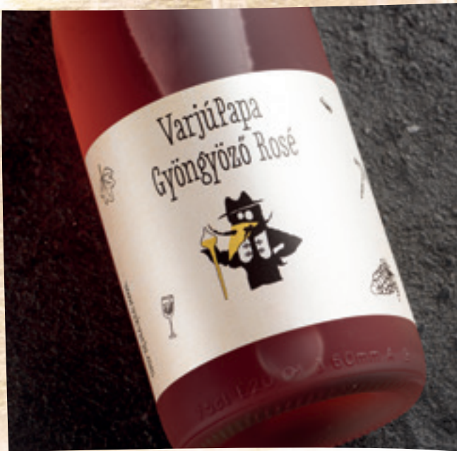
VarjúPapa's rosé wine 4 290 HUF/bottle/take away