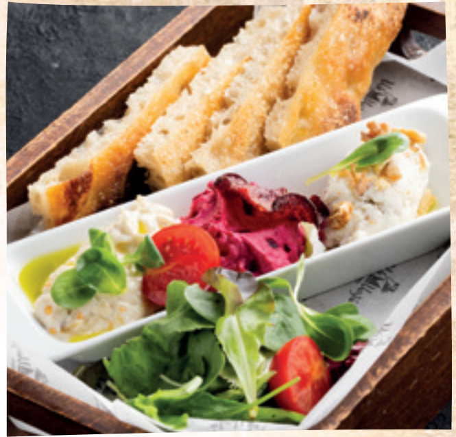
VakVarju's dip selection: Transylvanian eggplant cream, goat cheese cream with walnut, beetroot hummus with foccacia