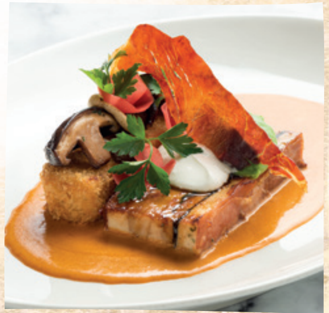
Pressed chicken "Bakony" style with roasted shiitake mushrooms and ewe's cheesy potato noodles in crispy coat